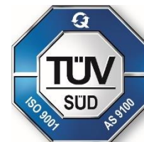
Greg Bates Director Business Assurance America Page 1 of 2

The certificate is valid from January 24, 2024 until January 23, 2027 With a re-issue date on N/A and a Certification Structure: Campus